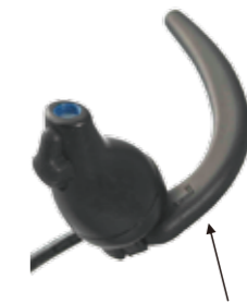
Removable for both left and right ear wearing